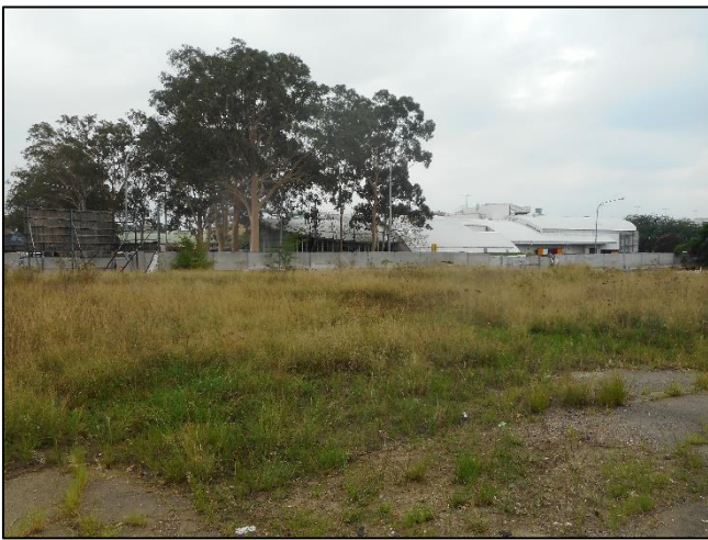
Photograph 1: Looking north east from south west boundary of study area.

The archaeological evidence, as outlined in this report, indicates that it is possible that subsurface archaeological deposits, and possibly insitu deposits could exist within the subject property. Excavation for foundations and services in relation to the proposed redevelopment has the potential to adversely impact on such deposits. Archaeological testing will be required to determine if subsurface Aboriginal objects are located within the subject property, and if so, their nature and extent. If Aboriginal objects are located on the property it will be necessary to apply for an AHIP with salvage.