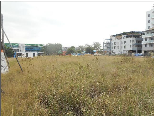
Photograph 2: looking south east from north west boundary of study area.

Showing property overgrown with weeds and grasses, no longer in use.