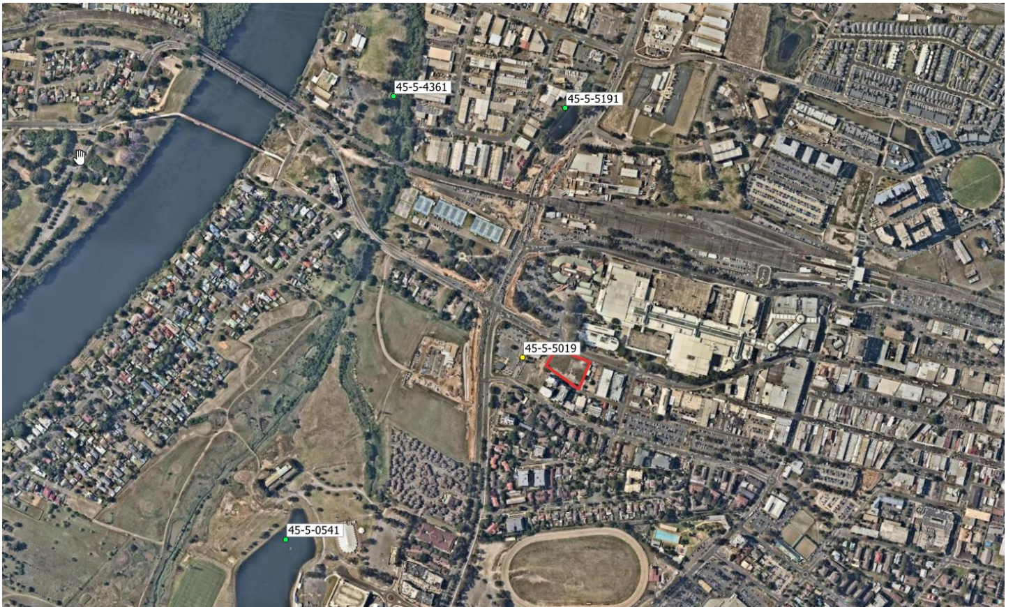
Figure 5: Study area edged in red. Registered sites indicated