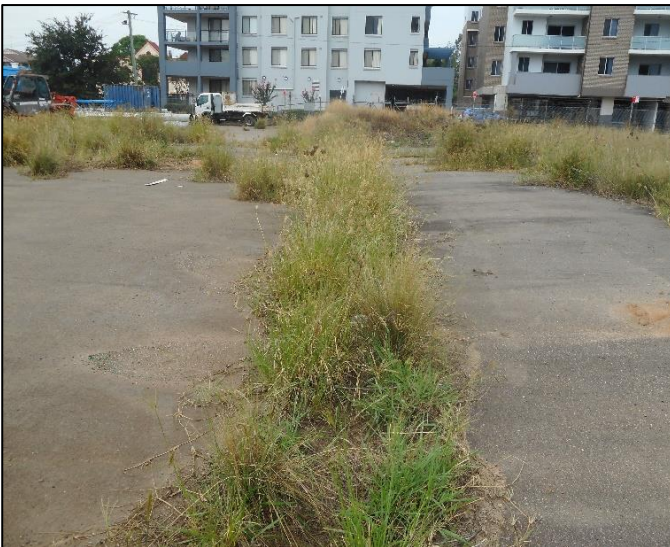
Photograph 4: Looking south showing shallow drain