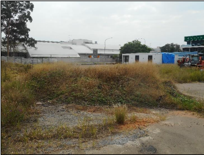
Photograph 3: Looking north east showing stockpile overgrown with grass.