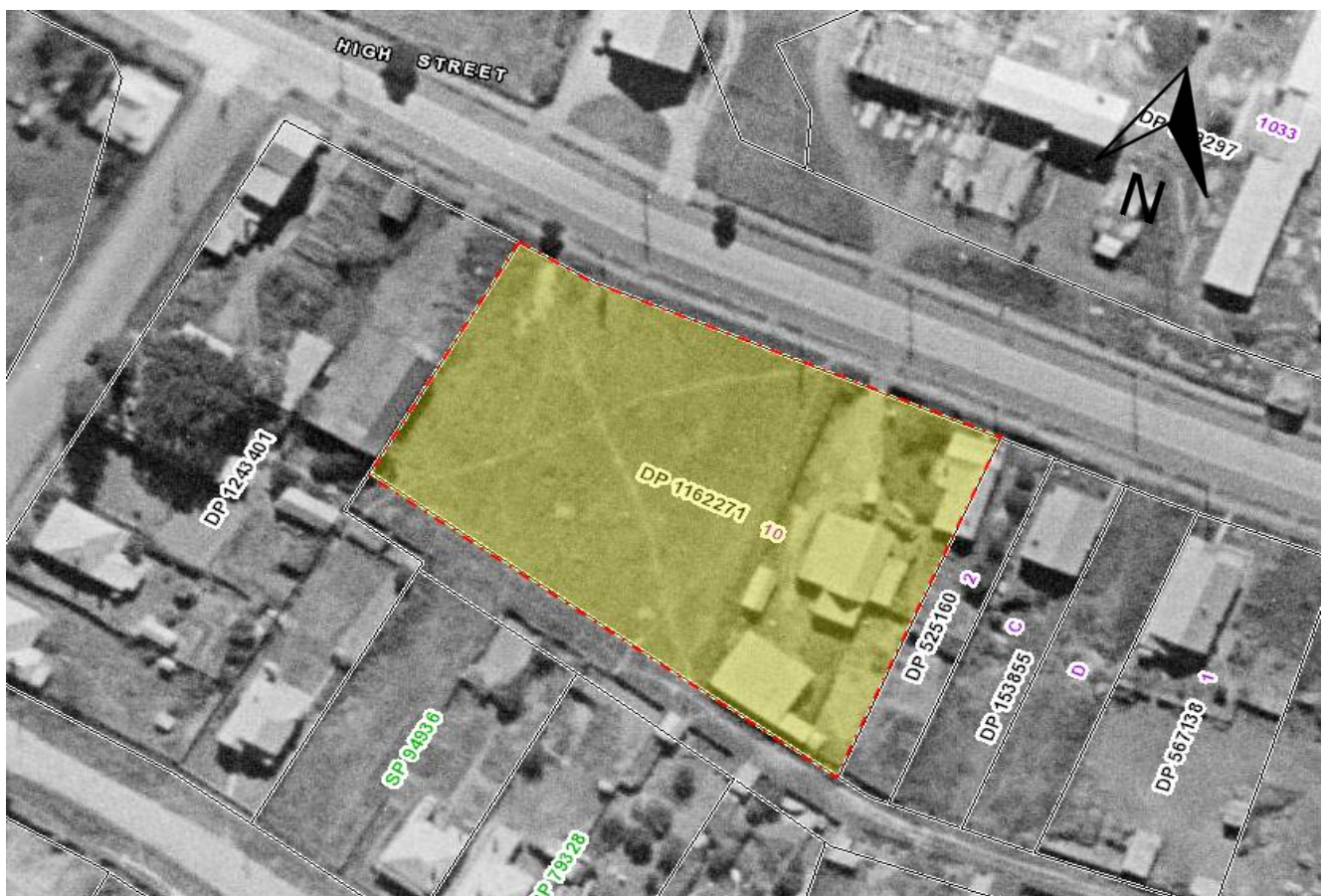
Figure 4: 1943 aerial with the study area edged in red.

The 1943 aerial photograph shown at Figure 4 indicates that structures were located along the eastern boundary. The remainder of the property appears to be vacant with minimal disturbance. Two walking tracks cross the property creating a visible 'X' through the property. By 2020 the building shown on the eastern boundary had been demolished. Currently, two advertising billboards are located in the north-western corner of the study area. A partially erected display suite is located along the eastern boundary. The south-eastern corner contains machinery with stockpiled construction materials. Towards the centre of the property is a large stockpile of demolished building waste materials. As indicated by previous archaeological excavations within the Penrith area despite such disturbance it is possible that sub-surface evidence of Aboriginal occupation could still remain on the site.