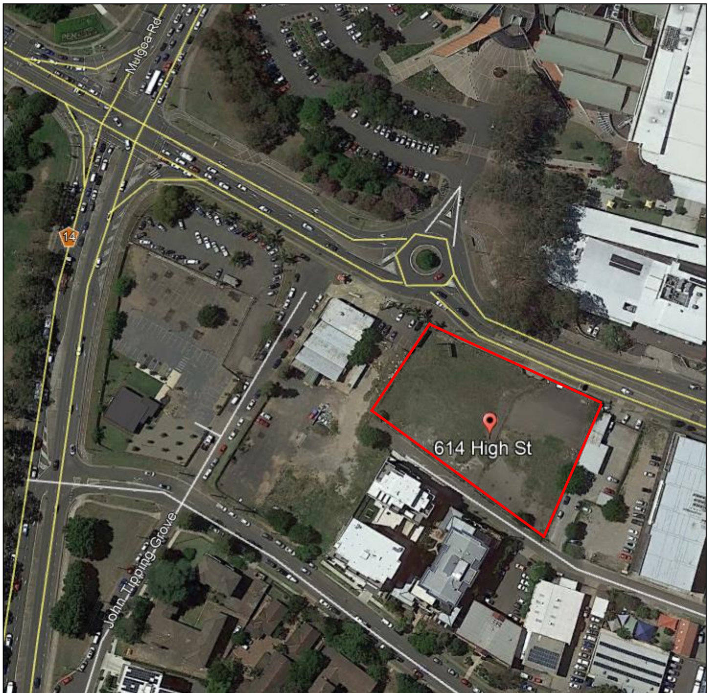
Figure 2: Study area edged in red